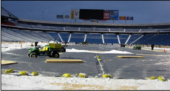
Ralph Wilson Stadium 2008 NHL Winter Classic

mission is to fulfill the responsibility of realizing our client's visions and achieving their goals through outstanding and exceptional service.