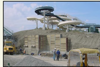
Barracuda Bay Ship Wreck Falls Darien Lake, NY