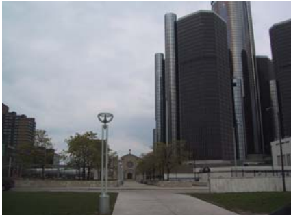
Hart Plaza Detroit, MI