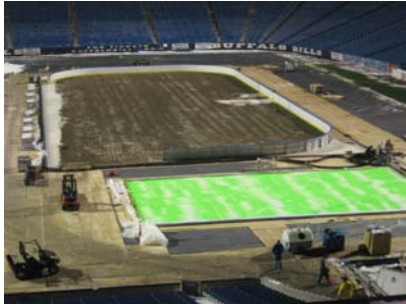
NHL Winter Classic Ralph Wilson Stadium Orchard Park, NY