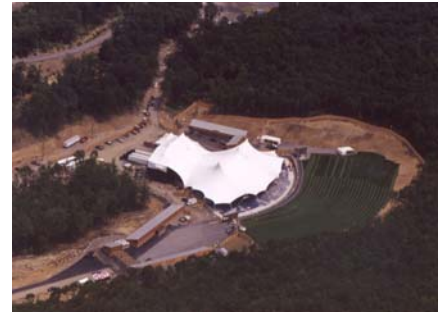
Montage Mountain Performing Arts Center Scranton, PA