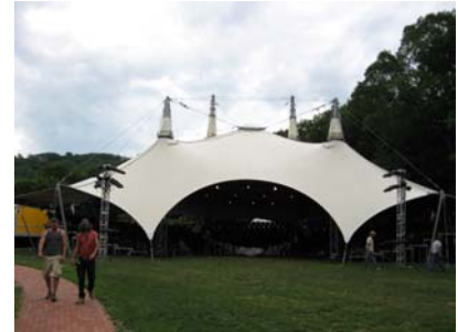
Hudson Valley Shakespeare Festival, Boscobel, Cold Springs, NY

2007 The Winter Classic - Ralph Wilson Stadium, Orchard Park, NY Project Manager/Design/Construction Services