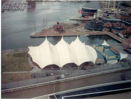
Pier Six Concert Pavilion Baltimore, MD