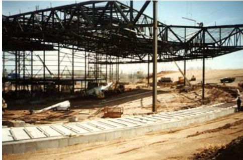
Hartford Meadows Music Theater Hartford, CT