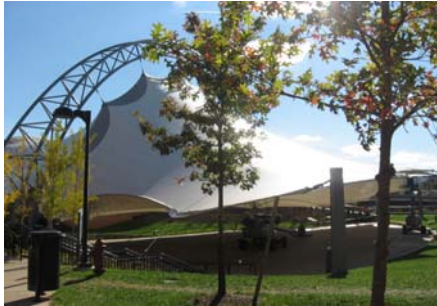
Charlottesville Music Pavilion Charlottesville, VA